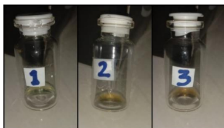
Figure 2. The results of the turmeric essential oil sample (1) powder (2) grated (3) pieces.

From the observations made, it was found that the essential oil was distilled by distillation. From the results obtained that the good essential oil was from a variety of powder forms because the volatile oil produced was very clear, and the second best result was produced through turmeric rhizome material with grated treatment because the more small surface area of the material affects the yield of the essential oil itself. The results of these essential oils can be seen in Figure 2 and Table 2.