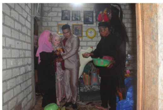
Figure 1. Barongan performance in the Ruwatan ceremony

Rituals are long-established social and religious activities in every culture (Khoury, 2017). Barongan Blora shows are inextricably linked to rituals in many events. This show has a mystical value following the beliefs of the local community and entertaining the audience. The community regards the Barongan Show as a symbol of appreciation to God for providing natural fertility and goodwill for the village community to develop. As a result, the Barongan show is only done on specified occasions, such as the sedekah bumi , bersih desa traditions, and tolak bala (lamporan) to fulfill its ritual role. In addition to these ceremonies, the Barongan show is presented at the wedding ruwatan (selamatan) ceremony as a form of gratitude for the bride and groom and to rid the household of bala (misfortunes) that will be lived in (see figure 1).