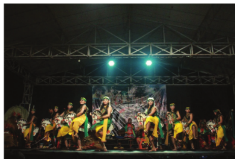
Figure 11. Modern Barongan show

Both internal and external factors induce changes in the function of the Barongan show. Internal elements include the development of dancer skills and the creativity of the artists of the Barongan dance group in processing movements and composing shows to meet the needs of the times. Incorporating various moves, outfit changes, and creativity in the design of each character's mask properties is a crucial development of the modern Barongan show. In modern Barongan , there are additional musical instruments in the shape of keyboards and sound systems, which allow the sound of the show to be heard up to the area behind the audience. Furthermore, modifications may be noticed in the shape of the Barongan show, which combines dance aspects (movement, space, and time) with numerous other supporting elements like accompaniment, floor patterns, clothes, make-up, venue, and lighting (see figure 11).