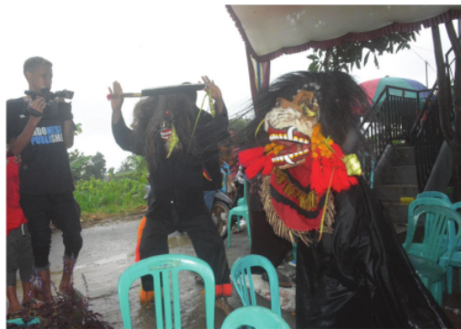
Figure 8. Barongan trance process during the show

When the trance players take their place in the center, they begin by peeling coconuts with their bare hands and playing with swords. If you look closely, the eyes of the tranced pembarong will turn crimson and glare as though they are enraged (see picture 8). The public believes in this phenomenon because of the involvement of spirits in the Barongan show, where the possessed dancers or spectators are under the influence of jinn and have immense supernatural energy to perform attractions.