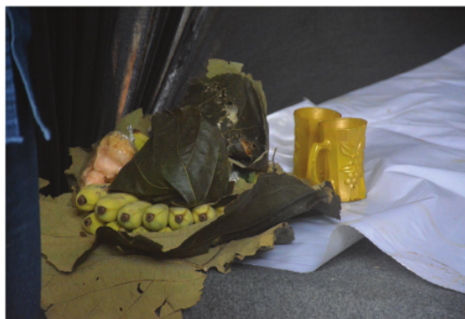
Figure 2. Traditional ceremonial offerings ( sesaji )

The village's clean tradition is still linked to the sedekah bumi , recognized by the exorcism ceremony. The exorcism is preceded by a slametan ritual in which offerings are made to the village dhanyang . They believe that the dhanyang is the village's guardian. Meanwhile, slamet means safe in this context. Therefore, this rite ensures that the people of the Hamlet are secure from bad spirits. The qualities of the offerings utilised in a slametan are derived from food offered by residents, which includes rice, side dishes, and various vegetables (see picture 2). These meals are then wrapped in teak leaves representing Blora's native vegetation. This demonstrates that the outcomes of nature can be reconnected with nature and become a sign of hope for nature, allowing people to live prosperously. As a symbol of natural knowledge, teak leaves are utilized as wrapping in Blora. This demonstrates residents' desire to live in harmony with nature. Another wish expressed during the clean village rite is for the village to be protected from evil spirits that disrupt the balance of its environment, such as floods, landslides, plant pests, and so on (see figure 2).