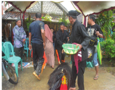
Figure 9. The process of awakening the pembarong who were in a trance

the show and even endanger the dancer's health. The tool the handler uses to awaken the dancer when he is in a trance is adjusted to the preferences of each dancer. These tools include keris, special oil, and handkerchiefs. The handkerchief used has been given oil and spells. The handler also provides incense and special perfume to awaken the rebels. If the pembarong is difficult to awaken and cannot be revived using a handkerchief, then the handler must use another medium, burnt incense. When awakening a pembarong in a trance, the handler must carry out several stages, among which the handler will choose which one to rest in the first stage. Second, splash water filled with flowers or yellow rice that has been given a spell. Third, if the energy from the spirits of the spirits is greater, the performer will have a higher frequency of trances so that the dances performed will be more attractive. Fourth, if the players start to get tired, they will take the prepared offerings and ask for something like a drink or food, then continue dancing again. Fifth, if the player has had enough of dancing, the dancer will approach the handler to ask to be revived (see picture 9).