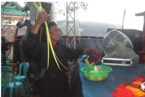
Figure 3. The handler recites the mantra before the event begins

begins, the handler must follow several rules: 1) The handler determines the show time, which is half past noon; 2) The handler selects a sacred Barongan show venue; 3) The handler prepares offerings in the form of yellow rice, coconut leaves, and incense (see figure 3) The handler recites the mantras before the ruwatan ceremony begins.