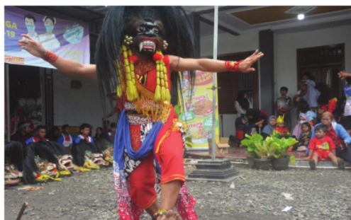
Figure 12. Male adolescent were imitating the Barongan dance

Female dancers' participation in modern Barongan is a distinct draw because male dancers have traditionally dominated Barongan shows. Still, over time, female dancers have been incorporated as a form of cultural preservation for all young people in Blora. Yet, there are distinctions between male and female Barongan dancers in the show arena. The male dancers will take on the part of the pembarong and perform tiger motions, while the female dancers will take on the role of kuda lumping dancers (see figure 12).