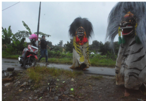
Figure 5. Barongan show on the village street

The show begins with the handler sprinkling yellow rice onto the stage area after reciting a prayer. Yellow rice is also planted along the road that the Barongan will pass over when it parades around the villagers' residences. Following the completion of the yellow rice sowing, the following stage is to blow the incense and incense that the charmer has spoken the spell on the pembarong . This is designed to encourage spirits into the pembarong 's body. The ruwatan ceremony's Barongan show begins with sounds from the gamelan or gong. The main course of the ceremony is Barongan . The appearance of the Barongan dancing like a tiger marks the offering rite to the ancestral spirits and The Almighty. Because the ceremony is surrounded by spiritual energy, when Barongan begins to perform, the environment will feel mysterious and beautiful. Changes in the behaviour of Barongan performers can be seen throughout the show. All of the Barongan dancers wander through the hand of the village in hand while dancing, emulating tiger movements, and performing difficult attractions (see figure 5).