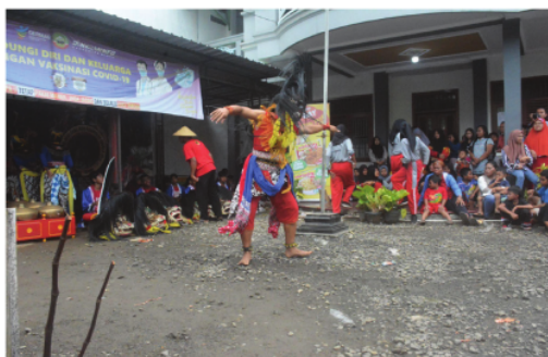
Figure 14. Barongan show on village event

Relationships with other parties, such as community leaders, politicians, government and private institutions, and businesses, are another external aspect. This other party will help the Barongan show by responding to (contracting for) their needs and desires (individuals, groups, institutions). Therefore, every Barongan group tries to establish relationships with anyone and any party seen as capable of responding to Barongan (see Figure 14).