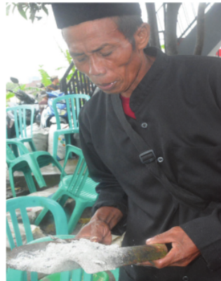
Figure 7. The handler wearing all-black clothes

This handler is also skilled at chanting incantations in a ceremony to summon and release spirits. The handler must dress in traditional Javanese attire, including a skullcap, slacks, and an all-black beskap. Meanwhile, the handlers who assist continue to wear all-black clothes but are not restricted in what they wear (see figure 7).