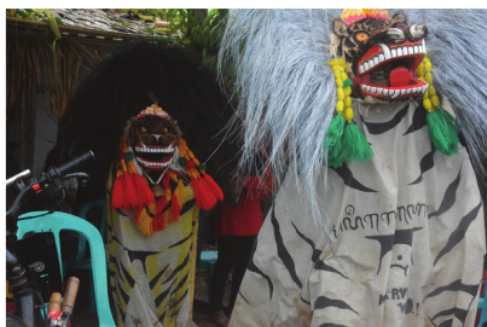
Figure 10. Traditional Barongan show

The Barongan show is currently a little looser in that it does not include ritual aspects in its presentation. This is due to the growing community demand for dancing aesthetics. Barongan shows for amusement and spectacle are not constrained by the same laws as Barongan shows for rituals, allowing for greater flexibility in their implementation (see Figure 10). This modification illustrates that the Barongan Blora show adapts to the times, as well as a method of cultural preservation to ensure that the show does not become extinct. This is because today's younger generation prefers shows that do not involve magical and mystical elements so that they can enjoy the beauty that radiates in every dance move without any intervention from other parties performing the ritual.