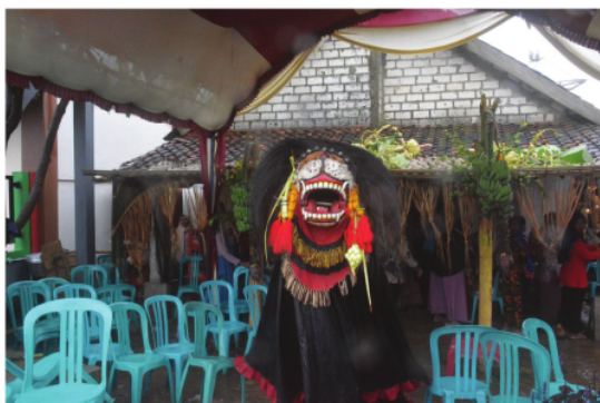
Figure 14. Barongan show on marriage ceremony

circumcised children or brides from evil spirits (see figure 13).