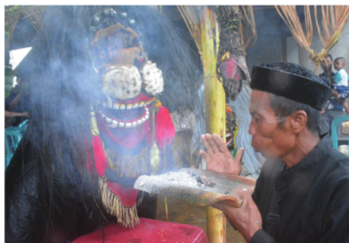
Figure 6. The ritual of summoning demon spirits to enter the pembarong 's body

The spontaneous motion codes show the interaction between the pembarong and the audience. It is not uncommon for Barongan dancers and spectators to fall into a trance. The trance phenomenon in dance and music is often seen as indispensable to help raise the performer's spirituality to a higher level and reduce the pain inflicted on the body when the dance action takes place. Possession can occur because of the influence of the strains of Javanese gamelan music used as an accompaniment to the Barongan show, which can affect the consciousness and psychology of those who hear it. According to Turner (2020) and Becker (1994), a constant rhythm of music might produce "possession" in a person. However, according to the dancers' story, the trance phenomenon happens when the show handlers actively put spirits into their bodies. The method of entering the spirits begins with the burning of frankincense and incense on the roof tiles and the recitation of spells, followed by the incense being blown to the pembarong by the handler (see figure 6). The followings are the prayers and charms used to bring spirits into the pembarong 's body.