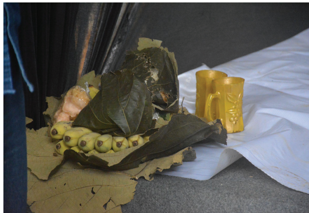
Figure 2. Traditional ceremonial offerings ( sesaji )

The village's clean tradition is still linked to the sedekah bumi , recognized by the exorcism ceremony. The exorcism is preceded by a slametan ritual in which offerings are made to the village dhanyang . They believe that the dhanyang is the village's guardian. Meanwhile, slamet means safe in this context. Therefore, this rite ensures that the people of the Hamlet are secure from bad spirits. The qualities of the offerings utilised in a slametan are derived from food offered by residents, which includes rice, side dishes, and various vegetables (see picture 2). These meals are then wrapped in teak leaves representing Blora's native vegetation. This demonstrates that the outcomes of nature can be reconnected with nature and become a sign of hope for nature, allowing people to live prosperously. As a symbol of natural knowledge, teak leaves are utilized as wrapping in Blora. This demonstrates residents' desire to live in harmony with nature. Another wish expressed during the clean village rite is for the village to be protected from evil spirits that disrupt the balance of its environment, such as floods, landslides, plant pests, and so on (see figure 2).