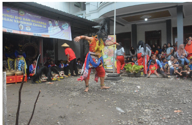
Figure 14. Barongan show on village event

Relationships with other parties, such as community leaders, politicians, government and private institutions, and businesses, are another external aspect. This other party will help the Barongan show by responding to (contracting for) their needs and desires (individuals, groups, institutions). Therefore, every Barongan group tries to establish relationships with anyone and any party seen as capable of responding to Barongan (see Figure 14).