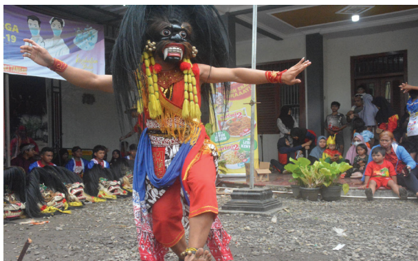
Figure 12. Male adolescent were imitating the Barongan dance

Female dancers' participation in modern Barongan is a distinct draw because male dancers have traditionally dominated Barongan shows. Still, over time, female dancers have been incorporated as a form of cultural preservation for all young people in Blora. Yet, there are distinctions between male and female Barongan dancers in the show arena. The male dancers will take on the part of the pembarong and perform tiger motions, while the female dancers will take on the role of kuda lumping dancers (see figure 12).