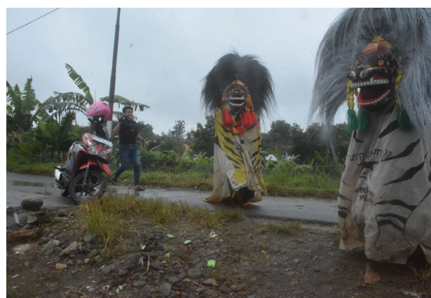
Figure 5. Barongan show on the village street

The show begins with the handler sprinkling yellow rice onto the stage area after reciting a prayer. Yellow rice is also planted along the road that the Barongan will pass over when it parades around the villagers’ residences. Following the completion of the yellow rice sowing, the following stage is to blow the incense and incense that the charmer has spoken the spell on the pembarong . This is designed to encourage spirits into the pembarong ’s body. The ruwatan ceremony’s Barongan show begins with sounds from the gamelan or gong. The main course of the ceremony is Barongan . The appearance of the Barongan dancing like a tiger marks the offering rite to the ancestral spirits and The Almighty. Because the ceremony is surrounded by spiritual energy, when Barongan begins to perform, the environment will feel mysterious and beautiful. Changes in the behaviour of Barongan performers can be seen throughout the show. All of the Barongan dancers wander through the hand of the village in hand while dancing, emulating tiger movements, and performing difficult attractions (see figure 5).