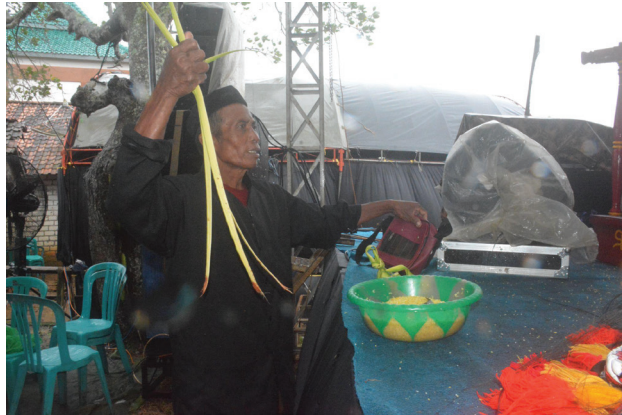
Figure 3. The handler recites the mantra before the event begins

begins, the handler must follow several rules: 1) The handler determines the show time, which is half past noon; 2) The handler selects a sacred Barongan show venue; 3) The handler prepares offerings in the form of yellow rice, coconut leaves, and incense (see figure 3) The handler recites the mantras before the ruwatan ceremony begins.