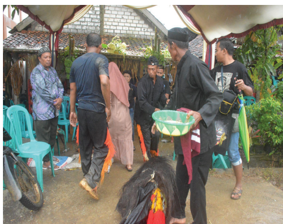
Figure 9. The process of awakening the pembarong who were in a trance

the show and even endanger the dancer's health. The tool the handler uses to awaken the dancer when he is in a trance is adjusted to the preferences of each dancer. These tools include keris, special oil, and handkerchiefs. The handkerchief used has been given oil and spells. The handler also provides incense and special perfume to awaken the rebels. If the pembarong is difficult to awaken and cannot be revived using a handkerchief, then the handler must use another medium, burnt incense. When awakening a pembarong in a trance, the handler must carry out several stages, among which the handler will choose which one to rest in the first stage. Second, splash water filled with flowers or yellow rice that has been given a spell. Third, if the energy from the spirits of the spirits is greater, the performer will have a higher frequency of trances so that the dances performed will be more attractive. Fourth, if the players start to get tired, they will take the prepared offerings and ask for something like a drink or food, then continue dancing again. Fifth, if the player has had enough of dancing, the dancer will approach the handler to ask to be revived (see picture 9).