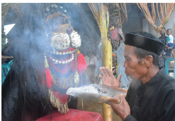
Figure 6. The ritual of summoning demon spirits to enter the pembarong 's body

The spontaneous motion codes show the interaction between the pembarong and the audience. It is not uncommon for Barongan dancers and spectators to fall into a trance. The trance phenomenon in dance and music is often seen as indispensable to help raise the performer's spirituality to a higher level and reduce the pain inflicted on the body when the dance action takes place. Possession can occur because of the influence of the strains of Javanese gamelan music used as an accompaniment to the Barongan show, which can affect the consciousness and psychology of those who hear it. According to Turner (2020) and Becker (1994), a constant rhythm of music might produce "possession" in a person. However, according to the dancers' story, the trance phenomenon happens when the show handlers actively put spirits into their bodies. The method of entering the spirits begins with the burning of frankincense and incense on the roof tiles and the recitation of spells, followed by the incense being blown to the pembarong by the handler (see figure 6). The followings are the prayers and charms used to bring spirits into the pembarong 's body.