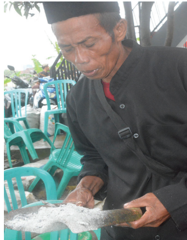
Figure 7. The handler wearing all-black clothes

This handler is also skilled at chanting incantations in a ceremony to summon and release spirits. The handler must dress in traditional Javanese attire, including a skullcap, slacks, and an all-black beskap. Meanwhile, the handlers who assist continue to wear all-black clothes but are not restricted in what they wear (see figure 7).