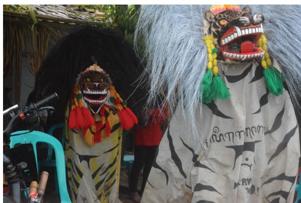
Figure 10. Traditional Barongan show

The Barongan show is currently a little looser in that it does not include ritual aspects in its presentation. This is due to the growing community demand for dancing aesthetics. Barongan shows for amusement and spectacle are not constrained by the same laws as Barongan shows for rituals, allowing for greater flexibility in their implementation (see Figure 10). This modification illustrates that the Barongan Blora show adapts to the times, as well as a method of cultural preservation to ensure that the show does not become extinct. This is because today's younger generation prefers shows that do not involve magical and mystical elements so that they can enjoy the beauty that radiates in every dance move without any intervention from other parties performing the ritual.