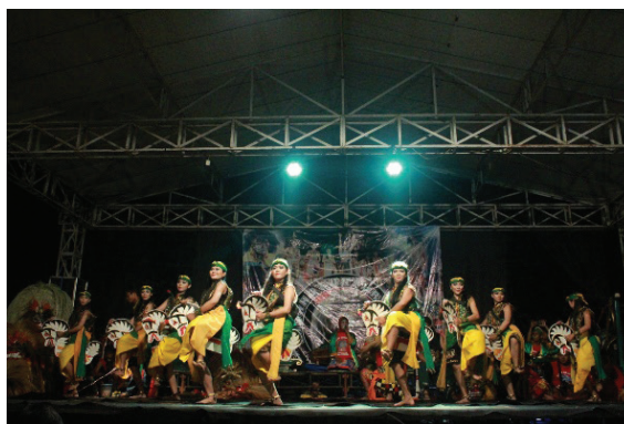
Figure 11. Modern Barongan show

Both internal and external factors induce changes in the function of the Barongan show. Internal elements include the development of dancer skills and the creativity of the artists of the Barongan dance group in processing movements and composing shows to meet the needs of the times. Incorporating various moves, outfit changes, and creativity in the design of each character's mask properties is a crucial development of the modern Barongan show. In modern Barongan , there are additional musical instruments in the shape of keyboards and sound systems, which allow the sound of the show to be heard up to the area behind the audience. Furthermore, modifications may be noticed in the shape of the Barongan show, which combines dance aspects (movement, space, and time) with numerous other supporting elements like accompaniment, floor patterns, clothes, make-up, venue, and lighting (see figure 11).