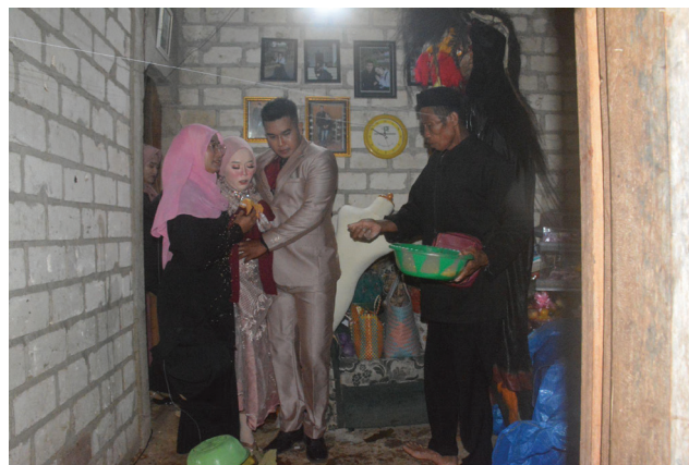
Figure 1. Barongan performance in the Ruwatan ceremony

Rituals are long-established social and religious activities in every culture (Khoury, 2017). Barongan Blora shows are inextricably linked to rituals in many events. This show has a mystical value following the beliefs of the local community and entertaining the audience. The community regards the Barongan Show as a symbol of appreciation to God for providing natural fertility and goodwill for the village community to develop. As a result, the Barongan show is only done on specified occasions, such as the sedekah bumi , bersih desa traditions, and tolak bala ( lamporan ) to fulfill its ritual role. In addition to these ceremonies, the Barongan show is presented at the wedding ruwatan ( selamatan ) ceremony as a form of gratitude for the bride and groom and to rid the household of bala (misfortunes) that will be lived in (see figure 1).