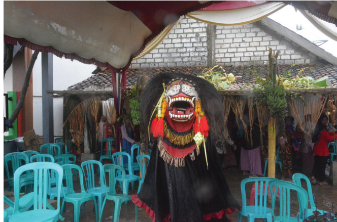
Figure 14. Barongan show on marriage ceremony

circumcised children or brides from evil spirits (see figure 13).