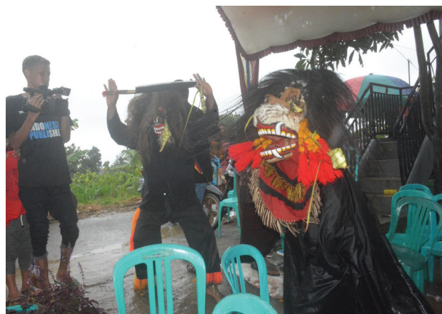
Figure 8. Barongan trance process during the show

When the trance players take their place in the center, they begin by peeling coconuts with their bare hands and playing with swords. If you look closely, the eyes of the tranced pembarong will turn crimson and glare as though they are enraged (see picture 8). The public believes in this phenomenon because of the involvement of spirits in the Barongan show, where the possessed dancers or spectators are under the influence of jinn and have immense supernatural energy to perform attractions.