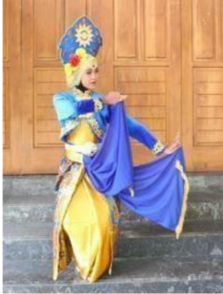
Figure 3: Bedhayan Gagrag Sumirat Puspito Dance, Variety of Tiptoe Tanjak Movements

movement position, starting with the head position: slightly turned to the left, looking at the right wrist. Body: standing straight, while in a rising position, also Hands: right in front, with the movement of the hands ngithing and squeezing the sampur, starting from the right hand and then moving to the left hand. As for the position of the feet: the right foot performs a gejuk movement when the right hand is pulled towards the front of the chest, which is then continued with the preparation of the trisik foot movement. This dance movement has a philosophical meaning stated in the philosophy of solah dance, namely the meaning as a reflection of tanjak, which means how to be more careful. This mindset is consistent with Number 5 of the Ten Muhammadiyah Personalities, which is to obey all laws, legislation, rules, and legal state principles. This harmony is represented by a range of solah tanjak movements, which contain features taken from basic values.