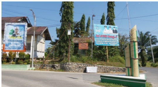
Figure 3. The Call to Avoid Gambling

The ballyhoo in figure 2, was installed in front of Langsa stadium. It contained an invitation from Langsa city government for not behave like non-muslim in welcoming the 2020 new year anniversary. Meanwhile, in figure 3, it showed an invitation to avoid gambling stalls.