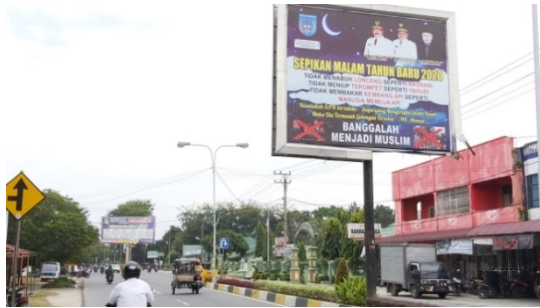
Figure 2. Proud to be Muslim