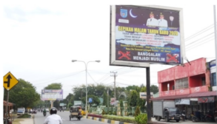
Figure 2. Proud to be Muslim