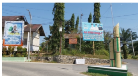
Figure 3. The Call to Avoid Gambling

The ballyhoo in figure 2, was installed in front of Langsa stadium. It contained an invitation from Langsa city government for not behave like non-muslim in welcoming the 2020 new year anniversary. Meanwhile, in figure 3, it showed an invitation to avoid gambling stalls.