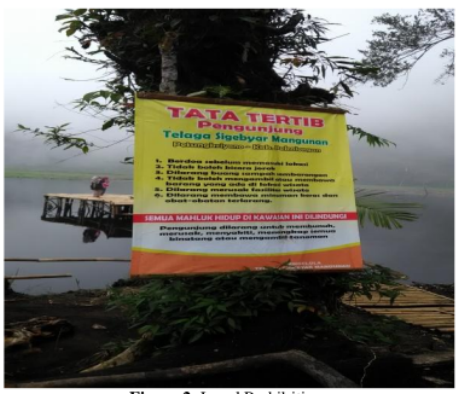
Figure 2. Local Prohibitions

Local prohibitions that exist in the Telaga Mangunan environment are no talking dirty, prohibited from littering, not carrying items in the lake location, and prohibiting carrying illegal drugs. The following is a picture of a notice board regarding the prohibition on Telaga Mangunan.