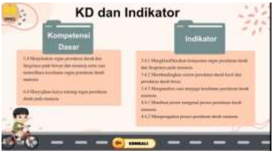
Figure 5. Learning Target