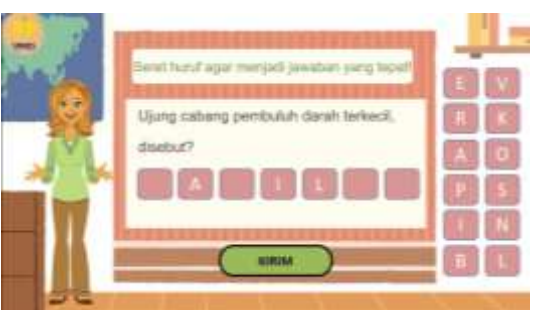
Figure 9. Easy Question