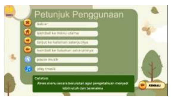
Figure 3. Instruction

Elsa Arni Rahmadhani et.al. The media Spedatua of human circulatory system based on articulate storyline to improve primary school science learning outcomes