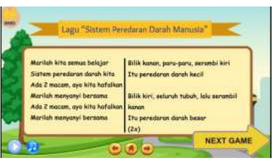
Figure 7. Song