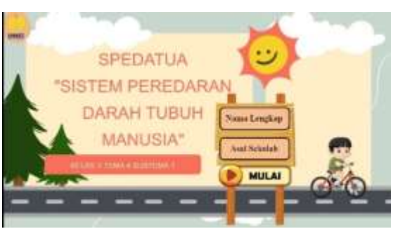
Figure 1. Cover

adapted to basic competencies, indicators and learning objectives. For further details, the following media product designs are presented by researchers.