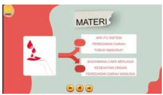
Figure 6. Matery