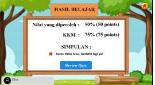
Figure 12. Results