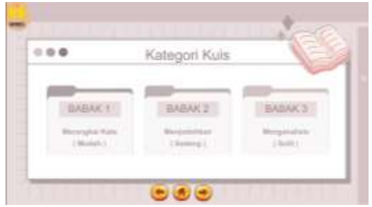
Figure 8. Quiz Category