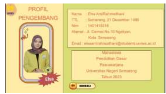
Figure 4. Author Information