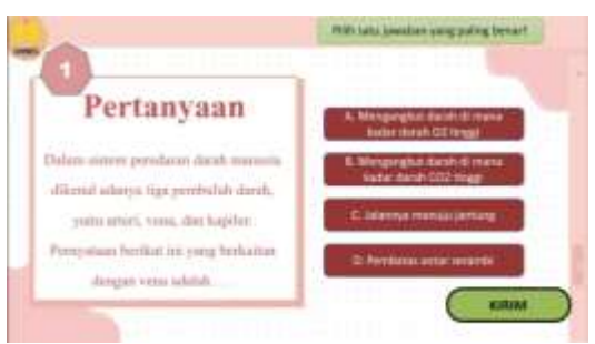
Figure 11. Difficult Question