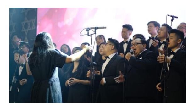
Photo 01. Higher Than Ever Church Choir Team (Researcher Observation 12/12/2021)

Ever Church. The researchers observed the choir, music team, trumpeters, and dancers in the photos below.