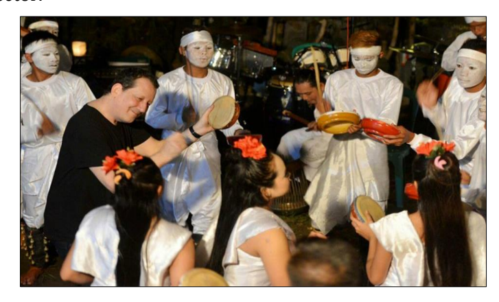
Fig 3. Trunthung Music Performance at Borobudur Jazz Festival 2016

celebrating the rich cultural heritage of the region and promoting local artistic traditions, the festival contributed to the preservation and sustainable development of Magelang Regency's cultural tourism sector.