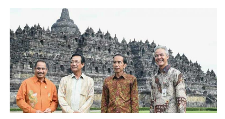
Fig 4. President Joko Widodo at Borobudur Temple, Magelang, Central Java, Friday, accompanied from left to right: Minister of Tourism Arief Yahya, Governor of DIY Sri Sultan Hamengku Buwono X, and Governor of Central Java Ganjar Pranowo

exemplified the potential of ecotourism to create memorable experiences while promoting sustainable practices. The concert, which is fully supported by the Ministry of Tourism, is expected to be able to promote Borobudur Temple as a world cultural heritage. So that Borobudur is not only a location for rituals and spiritual tourism but also music, sports, culture, film and so on. This event was also attended by the President of the Republic of Indonesia along with the ministries and governors of DIY and Central Java, see Fig 4.