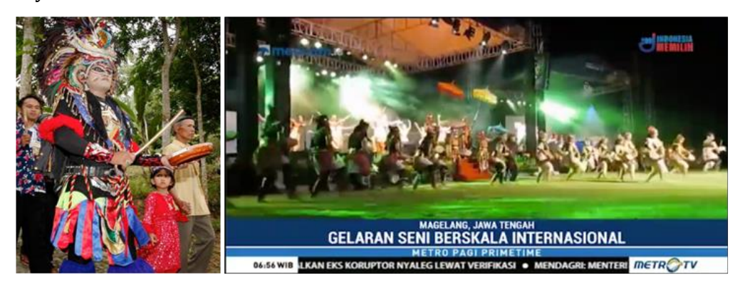
Fig 5. (a) Trunthung in Ritual Performance at Warangan Hamlet and (b) Trunthung Music Performance as an Opening Ceremony in the International Festival at Borobudur Temple

By examining Fig. 5 (a) Trunthung in Ritual Performance at Warangan Hamlet and Fig. 5 (b) (b) Trunthung Music Performance as an Opening Ceremony in the International Festival at Borobudur Temple, it becomes apparent that Trunthung Music has emerged as a significant local potential within the realm of ecotourism offerings. These visual representations provide compelling evidence of the impact and recognition of Trunthung Music, contributing to the distinct identity of Magelang Regency. The development of Trunthung Music has resulted in the creation of a monumental artistic achievement, known as Music Trunthung, which has successfully collaborated with various genres and musical groups. Notably, Trunthung performances have reached regional and national stages, indicating its growing recognition and popularity.