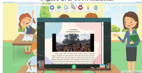
Figure 2. E-book material

Electronic book based on local wisdom tells the story of Nyai Sabirah, Bakaran Wetan Village. The role of understanding reading literacy in one story adapts social studies material to local wisdom in the students' environment in Pati district. Furthermore, media development includes local wisdom videos. The purpose of presenting the video is to maximize learning objectives teachers in conveying messages and subject matter to students so that messages are easier to understand, more interesting and more fun for students.