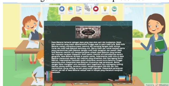
Figure 1. The material presented

Figure 1 is the material presented in the electronic book media that tells the story of local wisdom in the Juwana sub-district. The objective of the material is to use local wisdom so that students maintain the local wisdom in their environment. In addition, the material presented is so that students can improve reading literacy. The next characteristic development is the E-book which is presented as shown in Figure 2.