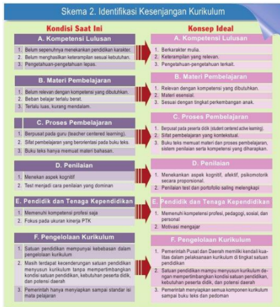
Figure 2. Shift old curriculum with prototype curriculum PAUD rate 2022 - 2024

Here is the shift old curriculum with prototype PAUD level curriculum