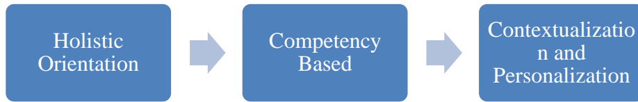
PAUD Prototype Curriculum Principle Flow

previous curriculum development by leading to the following.