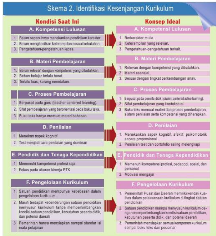
Figure 2. Shift old curriculum with prototype curriculum PAUD rate 2022 - 2024 (Source: https://www.paud.id/kurikulum-prototipe-paud-2022 )

Here is the shift old curriculum with prototype PAUD level curriculum