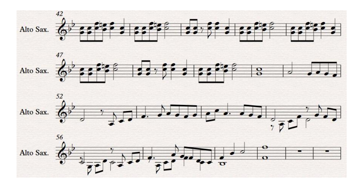
Filler Notation of the "Ikut Karnaval, ikut Dugderan" part