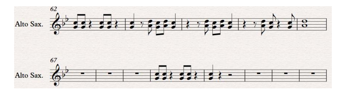
Filler Notation of the "Dugder Semarangan" part