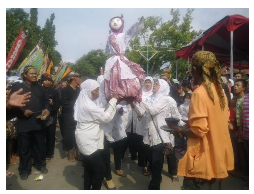
Figure 14. Brendung art Performance with procession

Although there are differences in performing Brendung art, its uniqueness has never been abandoned by its performers and fans. Its appearance is not only in one place, but it continues to walk according to the route of the procession. By this way, people who want to watch it do not need to come to the staging area, they just need to wait on the side of the road that the performance pass by. The following figure is a picture of Brendung art performance with the concept of a procession.