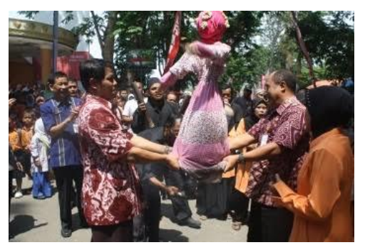
Figure 15. Participant holding Brendung doll

In every its performance, Sarwodadi community in Pemalang always involve the audience. The audience is usually invited to hold the doll which is dancing under the control of the spirit. It is done in order to make the audience feel the doll movement which has been possessed by the spirit. Beside that, they are also given the opportunity to play one of the musical instruments. The simple and repeated rhythmic pattern of the musical instruments makes it easy for the audience to play. They are also usually guided by the music players. Those things are done in order to make the audience become familiar with the performance and with the hope that they can always be familiar with the performance. The following figure is a picture of the audience who participate in the performance by holding the doll.