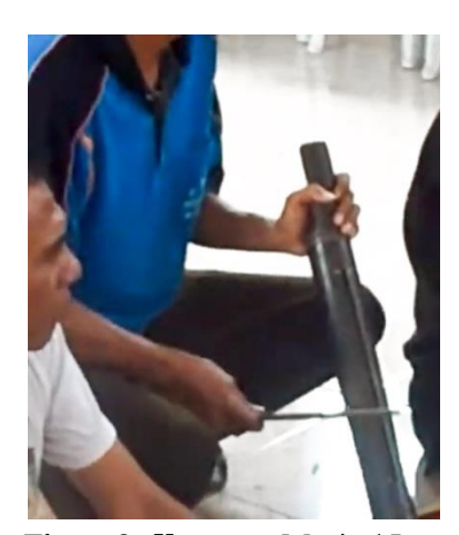
Figure 9. Kentongan Musical Instrument

In Brendung art, kentongan is used as one of the musical instruments to accompany the Brendung art performance. The way to play it is by beating its hole using a wooden stick. The following figure is a picture of kentongan used in Brendung art in Sarwodadi community, Pemalang Regency.