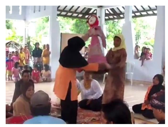
Figure 4. Brendung Doll Handlers

During the performance of Brendung art, if the holder of Brendung doll does not have good intentions or if they insult the doll, the Brendung doll will rebel and injure the holders of the doll with his head or hands moving against the body of the doll holder. The following is a photo of a mlandang or Brendung art doll holders in Sarwodadi community, Pemalang Regency.