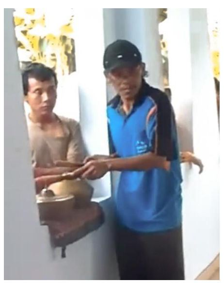
Figure 11. Kethuk Musical Instrument (Documentation: Bagus Nirwanto, 2020)

Kethuk is a gamelan instrument that looks like a kenong/bonang, but there are only two kethuk used in the performanceThey are put in a place that functions like a swing, so it is almost the same as kenong/bonang and kempyang. In Brendung art, there are two kethuk are used. The following figure is the picture of kethuk used in Brendung art in Sarwodadi community, Pemalang Regency: