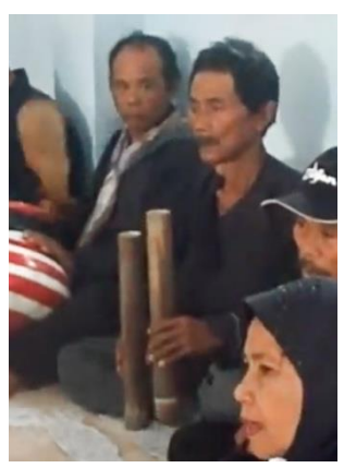
Figure 10. Kentongan Lantai Musical Instruments

art in Sarwodadi community, Pemalang Regency.