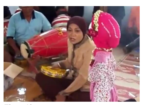
Figure 12. Tambourine musical instrument

it. The sound produced is the sound of tinkle and it can be combined with the sound of the beat from the membrane. This instrument is widely used in other arts such as dangdut music, Islamic tambourine group, gambus , etc. The following figure is a picture of a tambourine used in Brendung art in Sarwodadi community, Pemalang Regency.