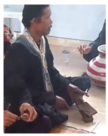
Figure 7. Kecrek Musical Instrument

Kendang is one of the instruments used in the gamelan of Central Java and West Java. The main function of it is to regulate the rhythm. Kendang is sounded with the palm of the hand directly without any other tools. The small type of kendang is called ketipung, the medium one is called kendang ciblon/kebar. There is one more pair of ketipung called kendang gede or commonly called kendang kalih.