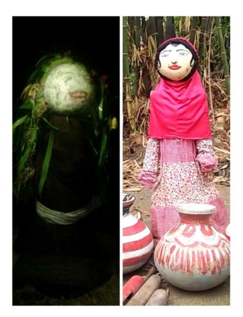
Figure 16. Brendung Doll Development (Documentation: Bagus Nirwanto, 2020)

In addition to make up Brendung doll's face, Brendung artists also put on some clothes on the doll. It is done in order to make it more interesting and to make it look like a beautiful woman. The clothes given to the doll can be changed in every performance so the audience will not get bored with its appeareance.