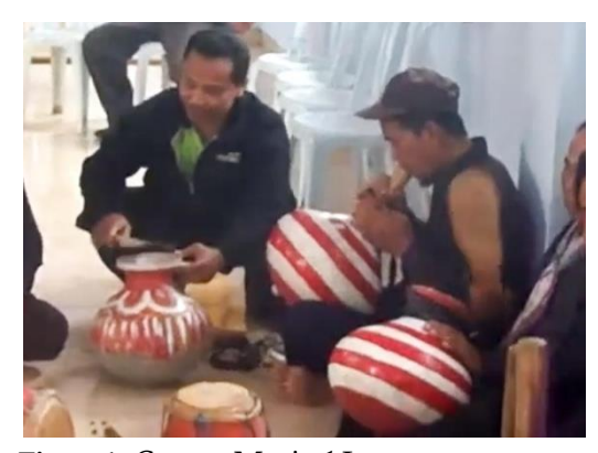
Figure 6. Gentong Musical Instruments

Second, by blowing gentong's hole using bamboo. The bamboo is inserted into gentong and then the player blows it from the bamboo hole so that it produces an echoing sound from inside gentong . The use of this instrument is a very unique thing, so that it makes its musical performance different from other. The following is a figure of gentong used in Brendung art, in Sarwodadi Community Pemalang Regency.