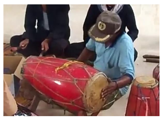
Figure 8. Kendang Musical Instruments

In Brendung art, the community does not only use the type of Javanese kendang , but also kendang ketipung that is used regularly on the genre of dangdut music. The difference is that in Brendung art, kendang ketipung used is made of plastic, while in dangdut music, it is made of leather. In the beginning of the performance, the players usually use kendang kalih with a slow tempo, and they will change to use kendang ketipung after the performance reaches the middle of the play. The following figure is a picture of kendang player of Brendung art at Sarwodadi community, Pemalang Regency.