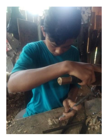
Figure 2 . Process of carving

All of the stages in the production process must be conducted carefully in order to minimize error. The third stage is mbuka'i or nggerak'i. This stage is the earliest stage to carve the wood using the pattern/sketch on its surface.