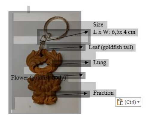
Figure 4 . Fauna Keychain

The object in the keychain carving above is a stylization of the goldfish shape as a whole from the embodiment of the keychain carving craft, which is produced every detail and based on the exact proportion. The size of the keychain carving above is 6.5 cm long and 4 cm