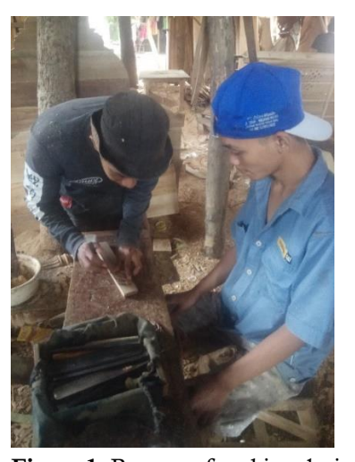
Figure 1 . Process of making design

The second stage is making the sketch on the wood surface. This stage can be done using pencils/markers.