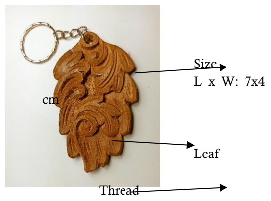
Figure 3 . Flora Keychain

The object of the keychain carving above is the leaf stylization as a whole from the embodiment of the keychain craft, which is produced every detail and based on the exact proportion. The size of the keychain above is 7 cm long and 4 cm wide. Besides that, the keychain above also has visual elements: lines, features, space, colors, and texture. The following is the explanation.