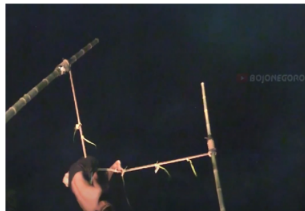
Figure 4. Kalongking Attractions (Action of Kalongking , according to public belief, moves because of the influence of supernatural beings)

The acrobatic attraction is performed with the eyes closed, climbing on the east bamboo pole and dancing in a bat-style movement which then hangs on to hook its legs on a rope with its head down and will descend on the west pole. All scenes shown through Kalongking represent every human being in the center ( pancer ) of life which is connected to the vertical pancer and horizontal pancer dimensions.