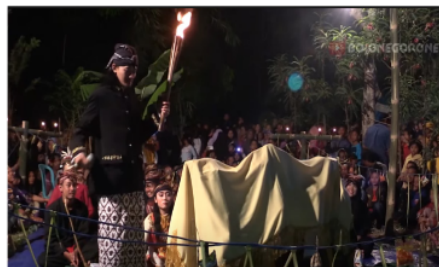
Figure 4. Pimp Nggundhisi scene ( Mendalang tells of the descent of the holy spirit "goddess" totaling 44 down to earth)

All the role players entered the arena stage accompanied by the song Kambang Otok with their heads covered with cloth, guided by makeup artists who carried torches as a guide to enter the arena. Then the torch was handed over to Pimp to circle Blabar Janur Kuning in a clockwise direction until he reached the north side facing east. In the next scene, Pimp starts Nggundhisi , the mastermind, who tells of the descent of 44 female holy spirits (goddesses) down to earth. Some are believed to have any involvement in shaping the characters in Sandur , becoming a kind of incarnation, or possessing the bodies of Sandur's role players. Among them is the incarnation of a goddess named Wilutomo , who entered the body of Pethak , Drustonolo entered the body of the Balong character, Gagar Mayang entered the body of Tangsil , and Suprobo entered the body of the Cawik figure. The incarnation of Irim-irim possessed Pimp , Panjak Ore , Panjak Kendhang , Panjak Gong , Kalongking , Craftsman Njaran , and other figures. The characters of the goddesses are believed to be incarnated in the body of the role players. This performance relates to the characters in the epics Ramayana and Mahabharata , which are often performed in wayang stories.