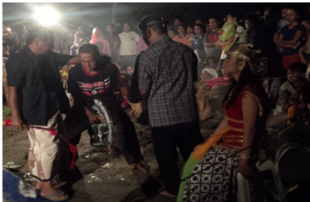
Figure 3. Jaranan Dance Scene ( Jaranan dance, according to people's beliefs, moves because of the influence of supernatural beings)

When the Jaranan dance scene begins to be presented, a series of songs are sung, which is believed to be a form of offering to mediate with spirit energy ( ndadi ). For example, the Jaranan dance scene ( Mbesa ) is accompanied by the song Kembang Le Li Le Lo Gempol , and then the Jaranan begins to circle the outside arena ( Mubeng Blabar ) accompanied by the Kembang Johar song, which serves to limit the pressure of the audience from the sacred arena. Next is the Jalok Ngombe in Jaranan scene accompanied by the song Kambang Jambe and the Jalok Leren scene accompanied by the Kembang Duren song. While releasing energy (awareness), the Jaranan players are accompanied by the song Kembang Jambu which means Jaranan asks for sleep.