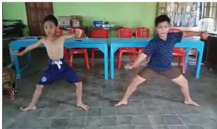
Figure 7. Rafka and Putra are practicing

groups of dancers in Facebook are Pecinta Seni Budaya Area Banyubiru (Banyubiru Art Appreciation Group). For this research, Reog'r has already had 78.1 thousand followers in Indonesia.