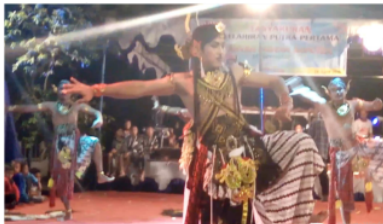
Figure 3. Baruklinthing troop from Bejalen, Ambarawa

The performance of Jaran Kepang for dance festivals or tourist entertainment is different to the dance for a ritual. For the festival, Jaran kepang is performed by following the rules demanded by the organizer. The repackaging of Jaran Kepang is based on the Surakarta style of the dance. It is evident from the movements, back sound, facial make-up, costumes, floor pattern, and properties. The following picture shows a performance done by Langen Budi Sedyo Utomo troop in the Festival of Jaran Kepang on Dream Land, Salatiga, on