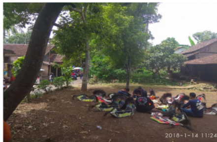
Figure 1. Pre-performance prayer

due to the spirit's invitation. The trances could happen at a sudden moment. The handlers were responsible for controlling the possessed people during the performance. The dance then continues with the culture of nyekar pepundhen (providing offerings), ngguyang jaran (handling the possessed), kepungan (controlling the possessed), citing mantras, and burning the incense. The handler prepares these activities before and during the events so that the performance can be executed well. The preparation includes asking the dancers to pray together before the public presentation (Figure 1).