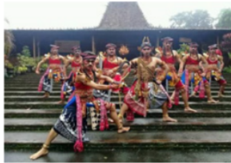
Figure 5. Langen Budi Sedyo Utomo group

changes of level and the element of dance composition. The background of the dance only came from bende , gong , and kendang . Nowadays, the back sound had additional sounds from pelog or slendro in the combination of pentatonic and diatonic music. The make-up and costumes of the dance followed the style of Surakartan ksatrian costume and make-up. In Figure 5, Langen Budi Sedyo Utomo group wears the make up and costumes for classical dance in Surakartan style.