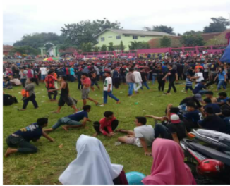
Figure 2. Mass possession of the dancers and audiences

this combination. Usually, the groups have known each other's members; thereby, they do not fix the price for the performance. The fee to hold a Rayonan was paid by the organizer. The dance troop will get a transportation allowance of Rp. 500.000,00 to Rp. 1.000.000,00 depending on the distance from the group's studio to the location of the performance (E. Kusumastuti, 2020a). In Figure 3, Baruklinthing dance troop from Bejalen, Ambarawa is performing on April 11, 2018.