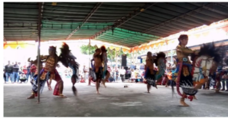
Figure 4. The performance from Langen Budi Sedyo Utomo Troop

The development of Jaran Kepang is based on three stages, training, management, and assistance based on the community-based art education (E. Kusumastuti, 2020b). The change of presentation comes from internal and external influences of society. The packaging of the performance is varied. It can be performed by adult or young male or female performers.