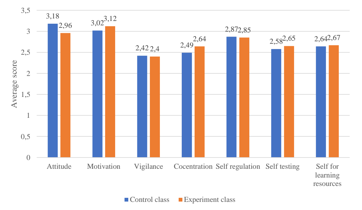
Figure 3. Comparison of the Average Scores of Self Regulation Indicator

Critical thinking skills test on self-regulation indicators by using a closed questionnaire. Some of the indicators used in the questionnaire include attitude, motivation, alertness, concentration, selfregulation, self-examination and finding learning resources. The average result of the self-regulation questionnaire for the control class was 2.74 which was included in the very good category, while the average result of the self-regulation questionnaire for the experimental class is 2.76 which is included in the very good category. The results of the comparison of the average value of each indicator of self regulation between the control class and the experimental class can be seen in Figure 3.