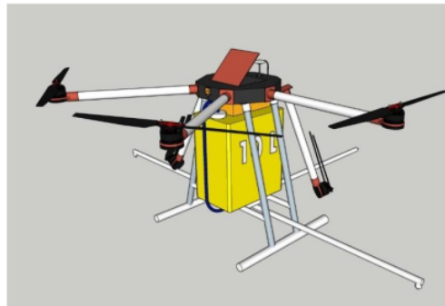
Figure 3. Hexacopter design

60°, and a propeller diameter of 200 mm. The final design of the hexacopter design as shown in Figure 3 below.