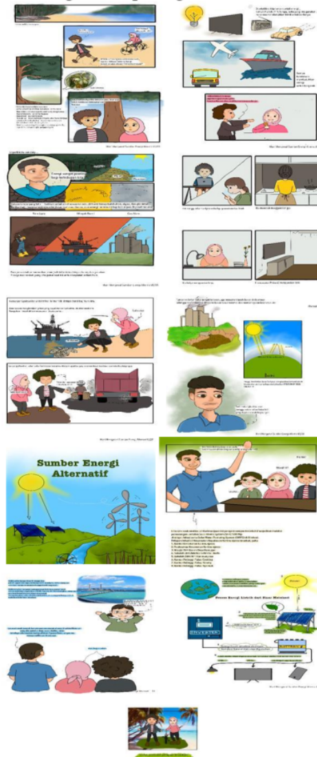
Figure 5 Contents of E-comic

The last stage after the learning media was developed, the media was validated by media experts, material experts, learning experts and individual tests. Evaluation by experts is done by filling out the questionnaire that has been provided. The following is a validation test conducted by experts.