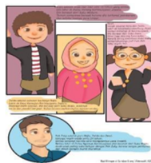
Figure 3 Introduction of E-comic Characters