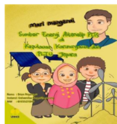
Figure 2 Cover E-comic

The E-comic book product based on Local Wisdom "Let's Get to Know Alternative Energy Sources of PLTS in the Karimunjawa Islands and PLTU Jepara" has been registered with HKI, and is already in the status of "ACCEPTABLE" with number EC00202177738. Display of e-comic books based on local wisdom, students can access the google drive link ( https://drive.google.com/file/d/12cOthT13iTeFVncjvIZxKfjt8cGZ76Q/view?usp=sharing ).