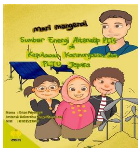
Figure 2 Cover E-comic

The E-comic book product based on Local Wisdom "Let's Get to Know Alternative Energy Sources of PLTS in the Karimunjawa Islands and PLTU Jepara" has been registered with HKI, and is already in the status of "ACCEPTABLE" with number EC00202177738. Display of e-comic books based on local wisdom, students can access the google drive link ( https://drive.google.com/file/d/12cOthTl3iTeFVncjvIZtxKfjt8cGZ76Q/view?usp=sharing ).