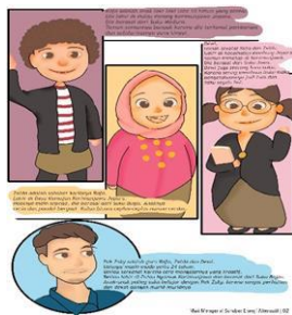
Figure 3 Introduction of E-comic Characters