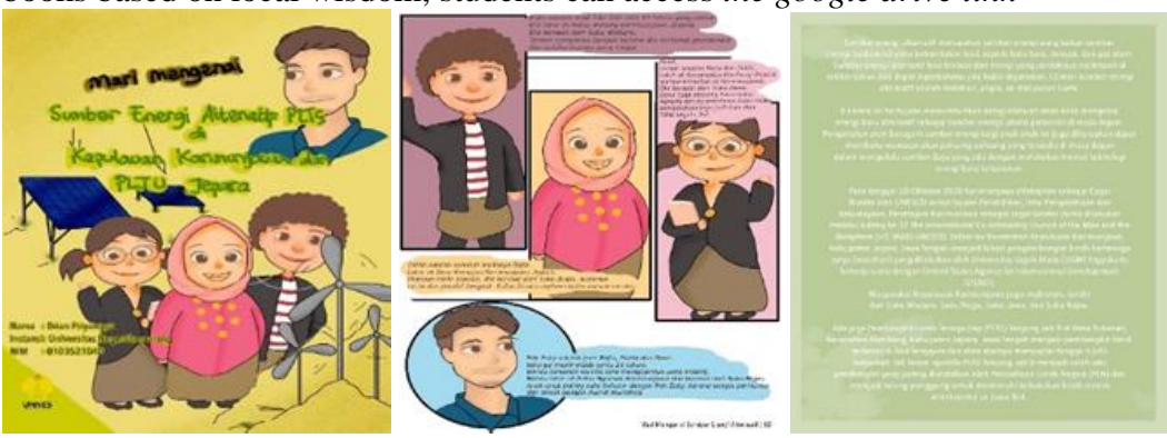
Figure 1 Cover of E-comic , Picture 2 Introduction of E-comic Characters , Picture 3 Opening of E-comic

The e-comic book based on local wisdom "Let's Get to Know Alternative Energy Sources of PLTS in the Karimunjawa Islands and PLTU Jepara" is used as a means of assisting the learning process that presents material for alternative energy sources, changes in energy forms, due to excessive use of fossil fuels and the process of electrical energy from sunlight. the sun as a supporter of students' understanding to local wisdom-based problem solving. The development of e-comic media is used to foster environmental literacy. With this innovation, students can know and implement environmental literacy. The design of this e-comic was assisted by the Autodesk application program . Display of e-comic books based on local wisdom, students can access the google drive link