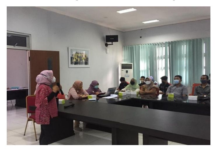
Figure 3. Formation of Youth Cadres by the Team

After mental health education and early detection of mental health disorders were carried out, the youth were formed as Youth Health Cadres for adolescent mental health. Youth cadres are formed as peer educators for their peers.