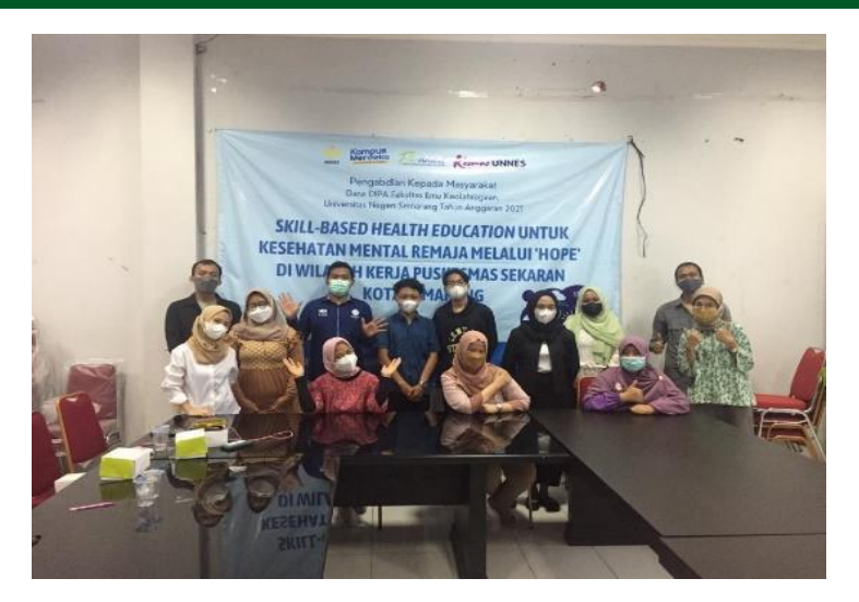
Figure 4. Group Photo with Youth Cadre