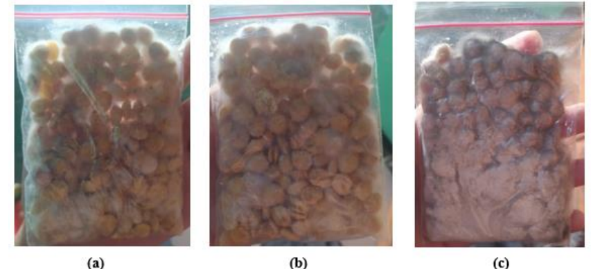
Figure 1. Saga Seed Tempe on Day 1 (12 hours), (a) Tempe I, (b) Tempe II, (c) Tempe III