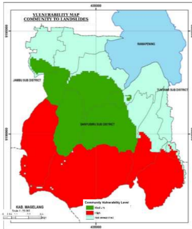
Figure 3: Map of level variation in landslide vulnerability in Banyubiru sub-District 19