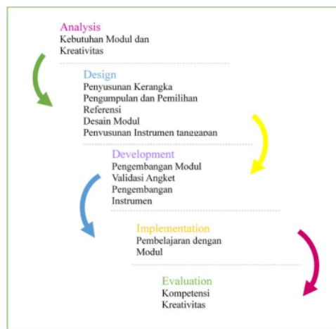
Figure 1. The Module Development Procedure Using ADDIE Model

The design of media development in this research is adapted from the ADDIE development model which consists of five stages of development, they are Analysis, Design, Development, Implementation, Evaluation (Alodwan,2018:43.) Educational development research includes the development process, product validation, product testing, and evaluation. The ADDIE model is a class-oriented development model. The stages of module development with the ADDIE model can be seen more clearly in Figure 1 below.