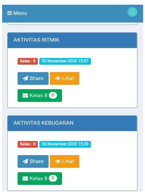
Figure 2. The Si-Prestasi App is difficult for students to access

obstacles of learning physical education online are experienced by all parties, schools, teachers, students, even parents and guardians of students at home feel this online learning obstacle. Teachers only have access to student movement activities via videos supplied by students via the wa group. Additionally, students face barriers when it comes to accessing online learning, which requires a stable and adequate internet connection. Numerous pupils at SMPN 1 Gondang expressed frustration with the school's Achievement APP for accessing learning materials. Interviews with parents and guardians of students revealed the same barriers to online learning: they were required to participate in the learning process their children were engaged in at home during the pandemic, and parents struggled to purchase internet quota for their children to access learning via learning apps.