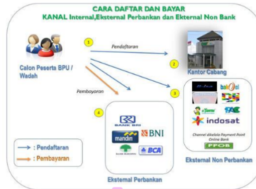
Fig. 1 Registration and payment model of Workers Social Security (BPJS Ketenagakerjaan) for workers of non-wage recipients

points/aggregators/banks every month/ three months/ six months/ one year.