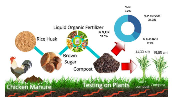
Figure 2. Schematic the process of making compost and its application

The process of making broiler chicken manure can be seen in Figure 2. With the addition of rice husks, brown sugar, and liquid organic fertilizer, this product has a high potential for the growth of spinach ( Ipomoea reptans Poir .) as evidenced in (Tables 2, 3). This manure contains the yield of N, P and K (Table 1), which supports the growth of water spinach. Based on the study results, the best results were obtained with the formulation of organic fertilizers when combined with soil. Research Hayat et al. (2021) on the use of manure and inorganic fertilizers reported that the nutrient content of Nitrogen (N) could stimulate plant vegetative growth.