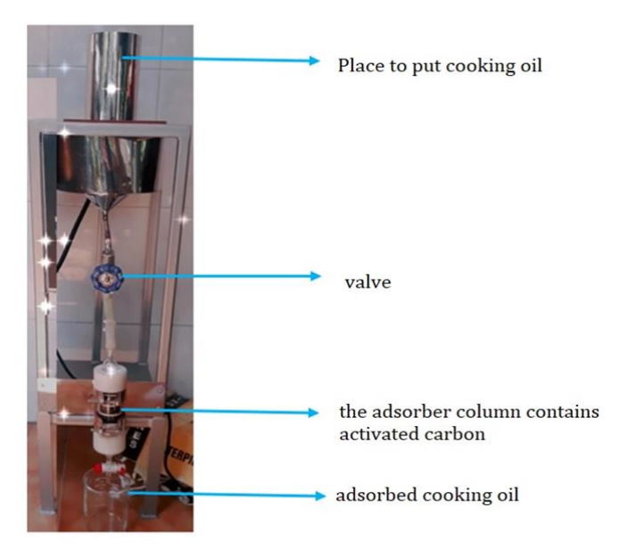
Figure 1. The process of purifying oil with activated carbon in the adsorber column

Implementation of Science and Technology Communities for in Pakintelan Village, Gunungpati District, Semarang City. Observation activities, residents want to provide knowledge and skills in the form of socialization of activated carbon benefits as a used oil purifier. They are checking the acid number data for four weeks to determine that the public already understands cooking oil for a maximum of 5 times for frying. This monitoring was carried out to determine when activated carbon is regenerated using activated carbon. The population showed the students monitored an increase in the five senses and the frying number, the acid number of the used cooking oil. The longer the acid number of cooking oil that has not been used is lower than the previous acid number as in Table 2. The acid number test results were informed to the occupant who owns the sample and keeps it from more than 0.6. In Table 1, it is presented that in In the first week, the use of cooking oil and up to 5% of the samples taken had understood not to continue their cooking oil for frying.