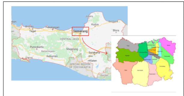
Figure 1: The Map of Semarang City, Indonesia

The case study in this paper is Semarang City, Indonesia, located between the 6°50' – 7°10' South and 109°35' – 110°50' East (Figure 1). The area of Semarang City is 373.70 km 2 , it has a tropical climate condition and the type of climate according to the Koppen classification is Tropical Monsoonal. The annual average temperature is 26.7°C. The population is made by 1,815,729 people and the population density is 4,253 per km 2 with a population growth of 1.6% per year [28]. Administratively, the City of Semarang is divided into 16 sub-districts [29]. Data from the Central Statistics Agency of Semarang City (2018) shows that electricity consumption in 2017 is 4,704,416 MWh/year or around 23% of the total electricity consumption in Central Java Province with an area of 32,801 km 2 . On a national scale, the number of customers has increased by 5.6% from the previous year, while electricity consumption has increased by 1.6% [30].