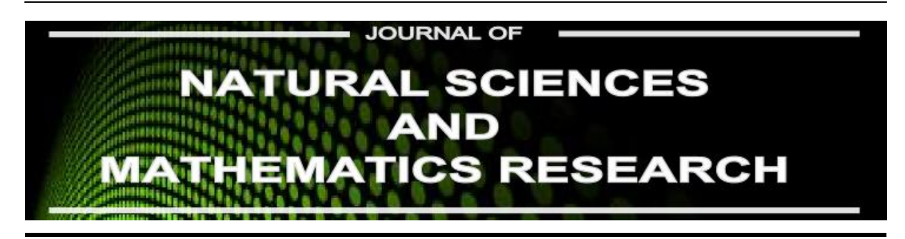
Available online at http://journal.walisongo.ac.id/index.php/jnsmr