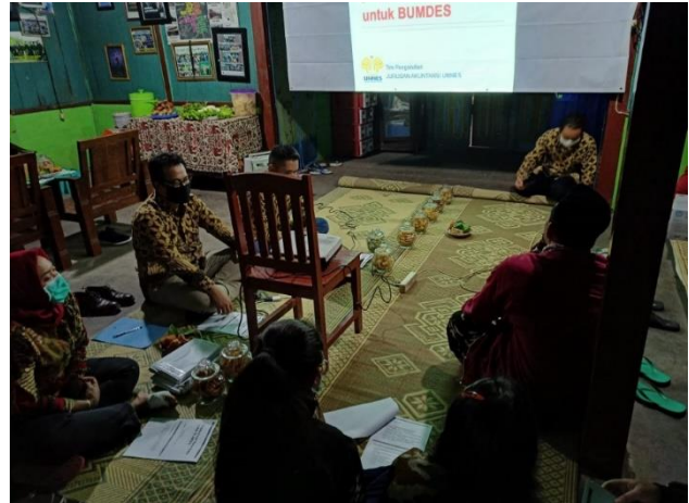
Figure 5. Photos During Exposure to Tourism Synchronicated and BUMDes

The results of the exposure and discussion between the service team and the service participants provide some changes in conditions that can be seen in table 1.