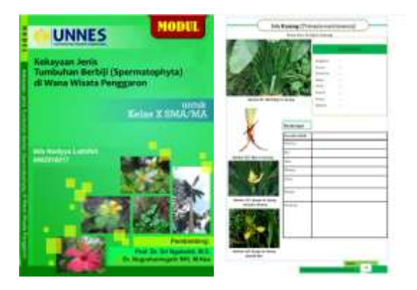
Figure 1. Display of cover and LKS contains species of seed plants (Spermatophytes)

Suggestions given by material and media experts, including image replacement which lacks contrast with the background, for example on Mimosa pudica leaves and unclear leaf reinforcement images, providing a dendogram column on phenetic and phylogenetic analysis material. Provision of columns makes it easier for students to work on and shorten the time so that the assignments are completed more quickly. Based on expert advice, the phenetic and phylogenetic analysis material should be accompanied by the answer signs displayed on the final page of the module. Developed module display presented in Figure 1.