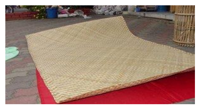
Figure 2. Klasa pandan

The results of the research could be seen in table 1, as follows.