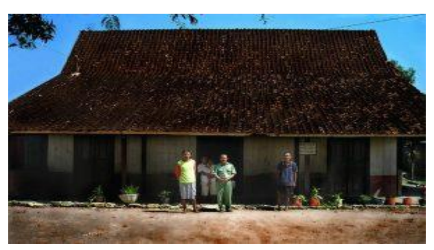
Figure 1. Bekuk Lulang Traditional house of Samin tribe