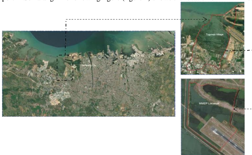
Figure 1. Research Location MMEP

This research was conducted in the tourist area of Maroon Mangrove Education Park (MMEP) located in Maroon Beach, Tugurejo Village, Semarang City. The MMEP location is near the runway end of Ahmad Yani Airport in Semarang. The following figure (figure 1) shows the location of MMEP research.