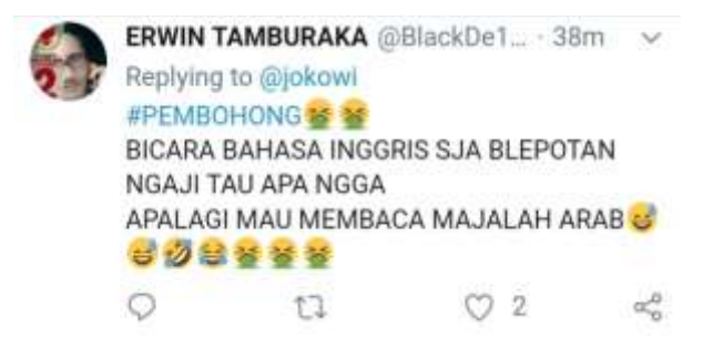
Figure 7. Hate Speech on @jakowi Instagram Accounts

"#LIAR TALK ABOUT TALKING ENGLISH GOOD WHAT IS THAT WHAT WILL YOU READ ARAB MAGAZINE "