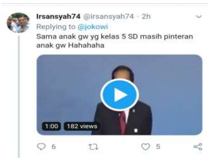
Figure 6. Hate Speech on @jakowi Instagram Accounts