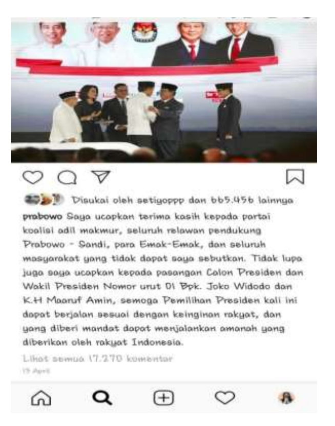
Figure 2. The official account holder Prabowo, on April 13, 2019@prabowo Instagram Account

Through Instagram, the official account holder Prabowo, on April 13, 2019, uploaded a photo with the following caption. "I thank the prosperous just coalition party, all the volunteers supporting Prabowo - Sandi, the moms (Emak-Emak) , and the whole community that I cannot mention. I also do not forget to say to the Candidates for President and Vice President, serial number 01 Joko Widodo and K.H Ma'ruf Amin, hopefully, this presidential election can run according to the wishes of the people, and those who are given the mandate can carry out the mandate given by the people of Indonesia".