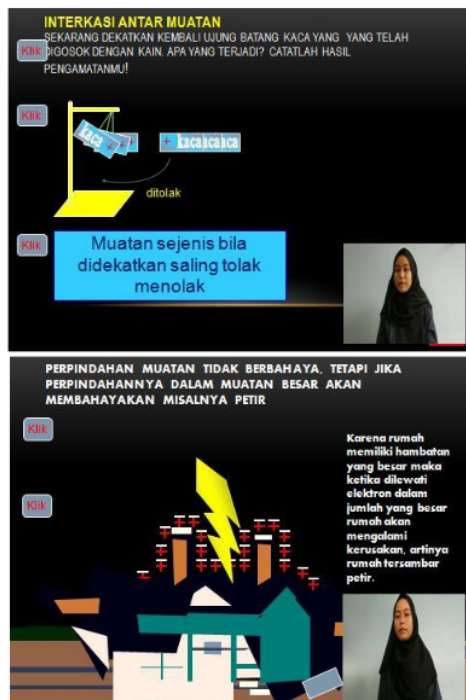
Figure 2. Interactive Video Display

According to Gazali & Nahdatain (2019) The delivery of material in learning videos must be interesting, the language used in learning videos must be simple and easy for students to understand. Learning videos make students more enthusiastic about learning, with learning videos can make deaf students not get bored learning science. The sentences and material used in this learning video are clear and easy to understand, the letters used are simple and easy to read, the language used in this learning video is simple and easy to understand.