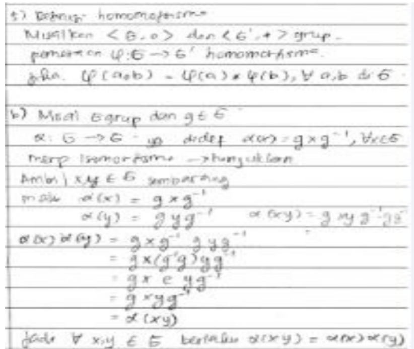
Figure 3. The Work on Problem 2 of M

Based on Figure 3 and the interview excerpt above, Subject M can state the definition of homomorphism, de-encapsulate Object of a group into the Processes of associative, identity element, and inverse elements, and coordinate the Processes of mapping, group, and axioms. She can prove the mapping \alpha is a homomorphism. In this case, she constructed the mental structure of Schema for the axiom, Process for the mapping, and Object for the group. The Schema of homomorphism has been thematized.