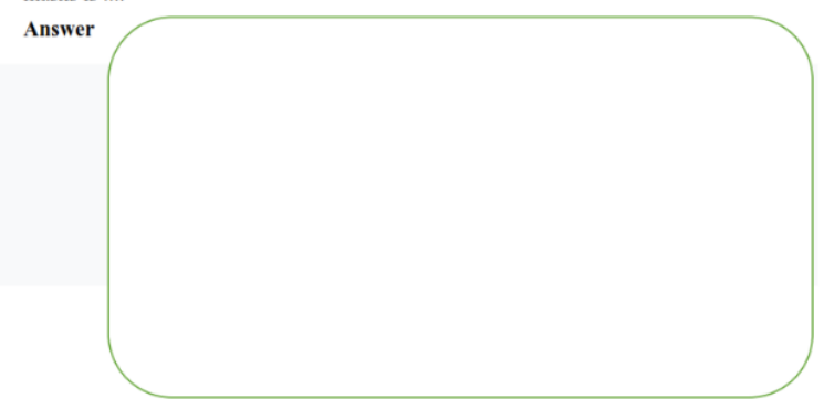
Figure 1. Example of Numerical Literacy Questions