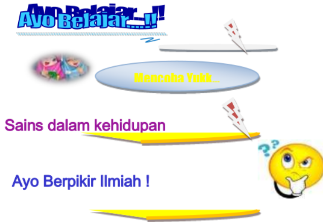
Figure 1. The sections representing each Aspect of Literacy of Science in the Materials.

Physics teaching materials on the theme of global warming symptoms was only focused on the component of scientific literacy. The scientific literacy aspect of the teaching material is science as the body of knowledge represented by the "Let's Learn" section, science as a way of investigating represented by the "Let's Try" part, science as a way to think (a way of thinking) represented by the "Let's Think" section, and the interaction of science, technology and society represented by the "Science in Life" section. The image of each aspect of scientific literacy from teaching materials based on the literacy of Global Warming is presented in Figure 1.