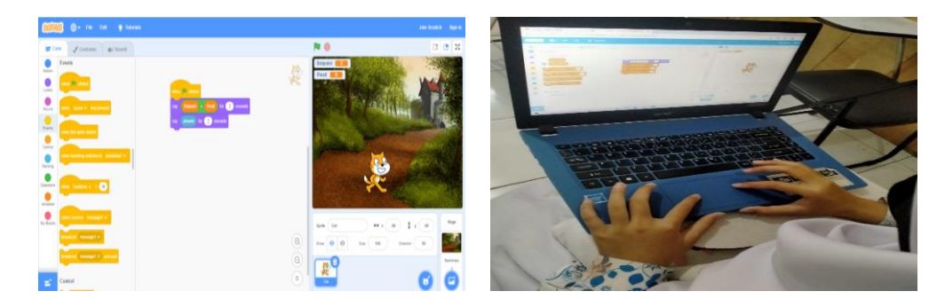
Figure 1. Examples of student activity while operating the Scratch button

The second meeting began by exploring the tasks that had been given in the first meeting. Students were asked the question, "Marcel bought a ballpoint pen and three pencils. How many items did Marcel buy? Make a mathematical sentence from the statement." Almost all students think into a mathematical sentence in symbols, for example, a pencil and a pen. According to epistemology, this process is called abstraction. The occurrence of abstraction goes from an unstructured abstraction to a developing abstraction [29].