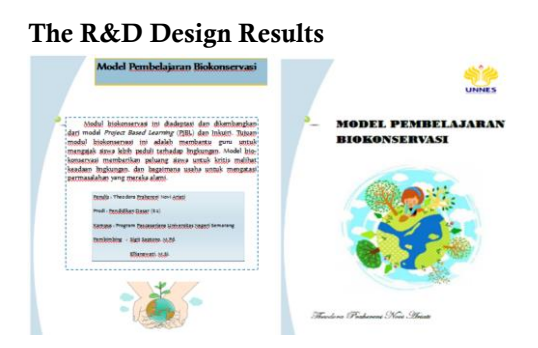
Figure 2 The Cover of R&D Design Result

pretest was done to determine the initial skills of students before using the bio conservation model. The comparison of pre-and post- learning outcomes of the model implementation on both groups is presented in Figure 3.