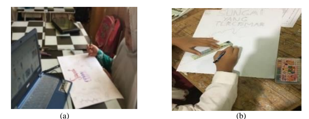
Figure 5. Art Aspect: Making a picture booklet related to learning and religious aspects.

After the engineering phase has been completed, the teacher asked students to create pictures stories related to the material that has been learned and still in line to SBdP material in class V of Elementary School. This aspect was called art. The process of mplementing the art aspect can be seen in Figure 5