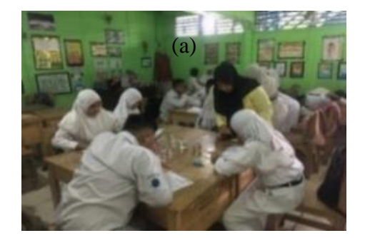
Figure 2. Technology Aspect in Product of Water Quality Test

In the next stage, students confirmed the data and information by accessing the internet related to the project presented in Figure 2.