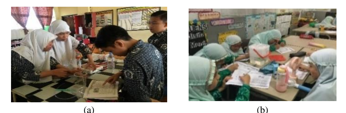
Figure 1. Science Aspects in Products of Drip Irrigation (a) and Water Cycle (b)

Based on the aspects of Science showed Figure 1, students were doing discussion in groups to identify the problems given by the teacher. It this Science Aspect, the first PjBL step appeared, namely the submission of essential questions. In this step, each group discussed and exchanged opinions to identify a problem from the questions given, In the discussion process, students were guided by using group worksheets to determine the right solution so that communication and