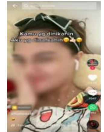
Figure 1. The Own HP and Handsfree

You're married, and I'm supported. Following this line are the feelings 'thumbs up, 'shuts up,' and 'kiss.' These sentences may indicate that women have issued incorrect punishments. This is indicated by the emotion 'shut up.' However, the statement You are married to, I am the one who is supported indicates that he truly loves and appreciates his status, and that even if he is not married to someone else's spouse, he still earns a 'living' or money. He complimented the lady for allowing her husband to provide for her needs. He also expressed gratitude to the man's husband for providing him with what he required.