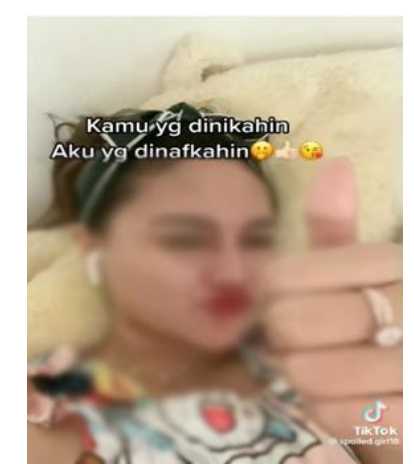
Figure 3. How Much Fun She Has Doing What She Does?

The image on the side is still of the closed-up variety. Closed eyes, pouted mouth, and thumbs up. This image depicts how much fun she has doing what she does. This is expressed by the thumb raised expression. The thumbs up represent hope, appreciation, thanks, praise, and thankfulness to God, oneself, and others, so that one day they can be top and first rate. A thumbs up with a pouty lip indicates that the lady is complimenting someone else's spouse, and she rewards her with a kiss. The wearing of a ring on the middle finger represents the uncompromising character's will to succeed. Furthermore, the ring on the middle finger signifies that you want to draw attention to yourself or show off your jewels. As a result, the woman's ring in the accompanying image signifies the fact that she will never stop having sex with other people's spouses.