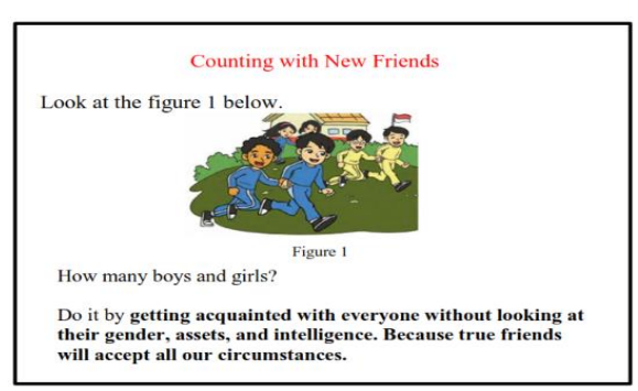
Figure 1 Calculates the Number of Friends Integrated with Character Values

The following are examples of the application of the integration of character values in mathematics learning in Elementary School of Indonesia. This example is for illustration only. Each teacher can develop or find their way better. Consider Figure 1 and Figure 2 below. The following are examples of character values that are integrated into the Mathematics learning process in textbooks of grade 1 of elementary school (Ministry of Education and Culture of the Republic of Indonesia, 2017).