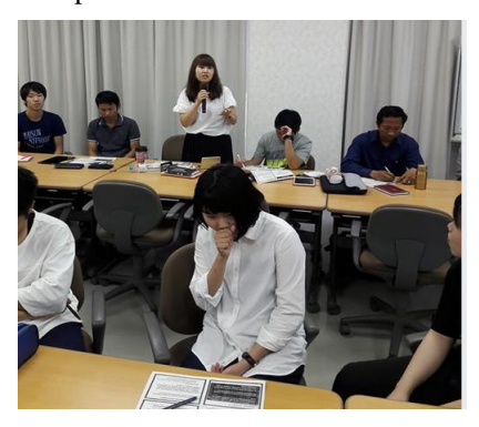
Figure 5 FGD Participant

FGD participants consisted of UNNES Research Team, the Partner Lecturer, and graduate students of IDEC of Hiroshima University. Students who participated in FGD were quite a lot. There were students from various countries, namely: Students from Indonesia, Philippines, Cambodia, Laos, Egypt, Rwanda, and Japan. Figure 5 below illustrates the atmosphere of the FGD path, where an IDEC graduate student was giving her opinion.