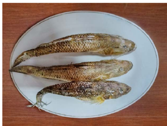
Figure 1 Picture bloso fish ( Glossogobius giuris sp.).

Bloso fish is a local fish in Indonesia and is well known with buto cina. Bloso fish are included in demersal fish, having a cigar-shaped body, round or slightly flattened, head pointed and depressed, and the muzzle is wider than their length. The general colour is brown above and silver at the bottom. Bloso fish spread in Indonesia until the West Pacific region.