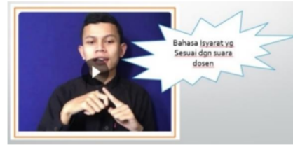
Figure 3: Sign Language

Next, a sign language translator video is made, in Figure 3 whose gesture must match the lecturer's voice narration.