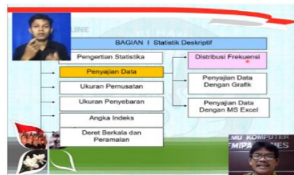
Figure 1: Basic Statistics Sketch

The development of assistive technology produced is as follows: (1) Identified the main courses in the department of computer science which for deaf students is relatively difficult to understand; (2) Courses that are difficult to understand by deaf students are then made into teaching materials in the form of video because lectures at UNNES are conducted online; (3) Videos that have been made are then combined with a video of a translator who translated the lecturer's explanation with sign language; (4) Thus, assistive technology for deaf students in the Department of Computer Science FMIPA UNNES through the interactive multi-function videos prototypes made can be applied inclusively in a lecture. At the prototype stage, 4 x 14 interactive multi-function videos have been made for courses: (1) Programming Algorithms and Data Structures, (2) Discrete Mathematics, (3) Introduction to Information Technology, and (4) Basic Statistics; (5) For the combination of 2 videos to be good and have the feasibility to be used as an assistive technology learning media, then the finishing of video making is submitted to the expert; (6) Example Figure 1, Sketch for Basic Statistics course is as follows ( see figure 1 ).