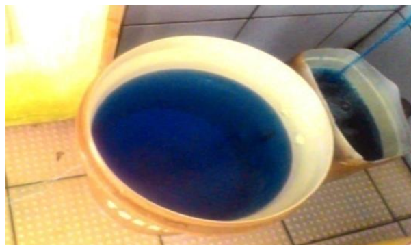
Figure 2. The Test Result Turbulence Flow with Colored Liquid

To identify the presence or absence of turbulence in liquids in a Toricelli tube, observe by observing whether or not there is a change in the rotation of the fluid during the lab or not. The identification of the magnitude of turbulence in the liquid is done by giving color to the liquid in tube I. It aims to know more clearly the magnitude of turbulence in the liquid. In the event of turbulence, there is a change in the rotation of the direction of water. The change can be known by observing whether or not the color of the liquid in the tube I when the water tap is opened and begin to fill the tube II. The results of trials to identify the presence of turbulence flow during the practicum process are shown in Figure 2.